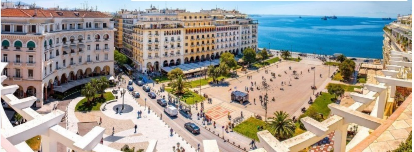
The annual congress of EAEC, Erasmus Congress and Exhibition 2022 Thessaloniki, Greece.

27 JUNE-1 JULY 2022, THESSALONIKI, GREECE VENUE: GRAND PALACE HOTEL