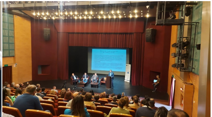
Cyber-security and Funding opportunities through European Union Programs May 3, 2022, Ramnicul Valcea, Romania