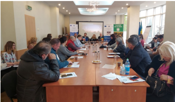
Digital Approaches to Communication Security and Entrepreneurial Learning March 10, 2022, Craiova, Romania